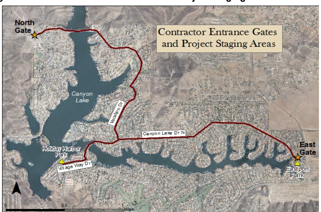
Figure 3 – Contractor Entrance Gates and Project Staging Areas

All commercial traffic associated with the project must be through the North (Greenwald) or East (Goetz) Gates, the main gate on Railroad Canyon Road is not available to commercial traffic. No commercial traffic is allowed before 7am, or after 5pm, Monday through Friday.